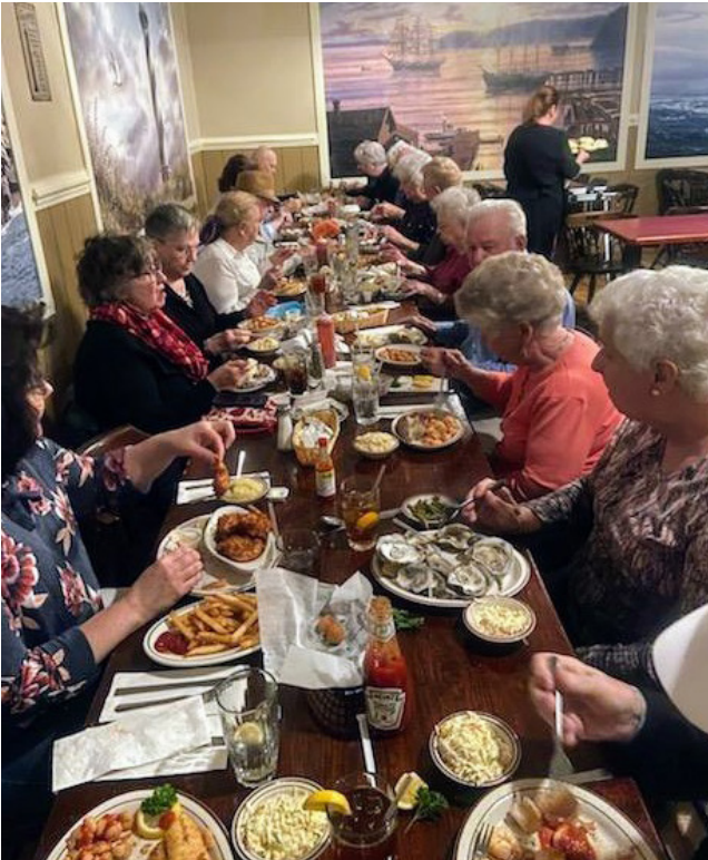
Senior Outing at Calabash Seafood Restaurant.

Below are pictures from a few of our senior events in February.