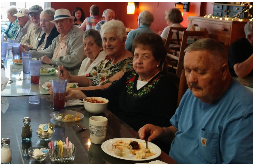
▲ April Senior Outing at The County Seat Restaurant in Powhatan.

Below are pictures from a few of our senior events in April.