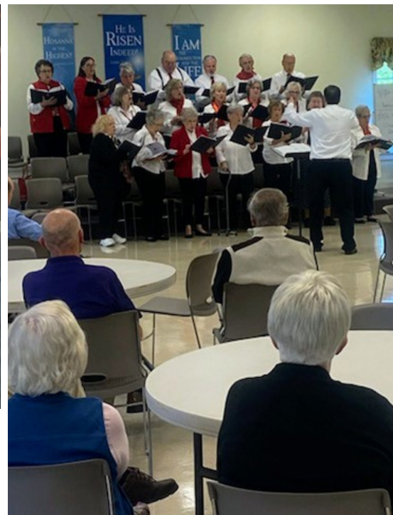
Mt. Vernon's "Young at Heart Choir" entertained our seniors during April's JOY Club. ▶