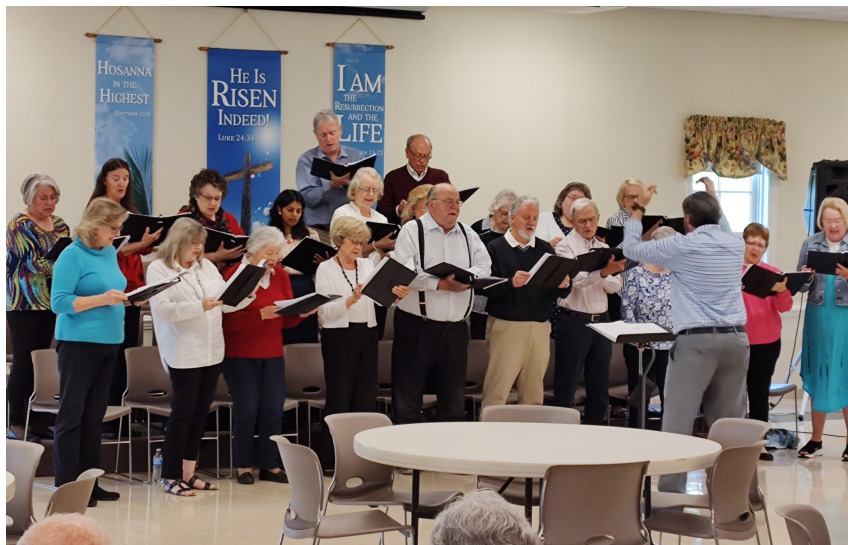
▲ GBC seniors enjoyed having the Mount Vernon's "Young at Heart" Choir. Lunch was Fried Chicken provided by Kitchen 33.

Below are pictures from a few of our senior events in April.