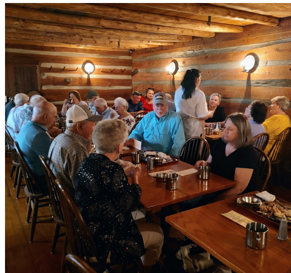
▲ For the April Senior Outing, GBC seniors had a delicious lunch at the Michie Tavern in Charlottesville.